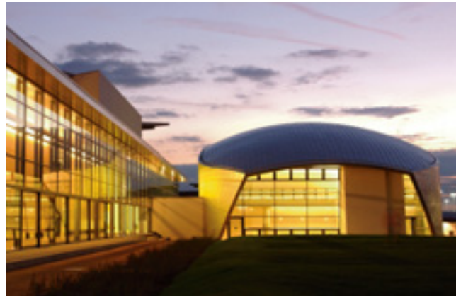
New prestigious award ceremony venue